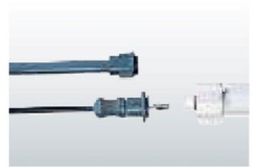
Interchangeable Electrode and Cannula Connection