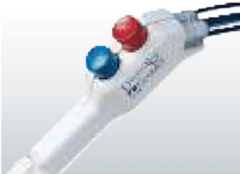
Foot Controlled Cut and Coag with Universal Cord Hand Controlled S/I