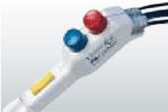
Hand Controlled Cut and Coag Rocker switch Hand Controlled S/I