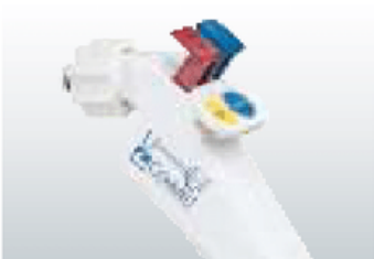
Hand Controlled Cut and Coag via buttons with tactile feel and click Hand Controlled S/I