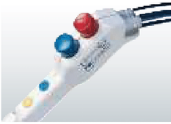
Hand Controlled Cut and Coag via E/S Buttons with tactile feel and click Hand Controlled S/I