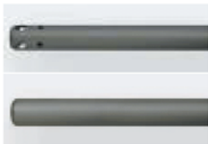
10/10mm Sump Cannula 60-6002-301, with side holes, 32cm 60-6002-307, with side holes, 15cm