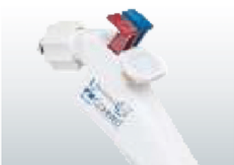
Foot Controlled Cut and Coag with Universal Cord Hand Controlled S/I