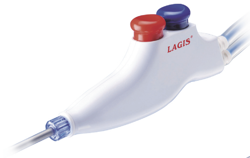
DirectFlow ™ Handle